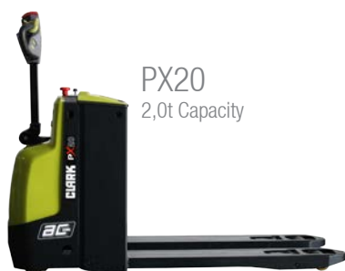
PX20 2,0t Capacity

Low chassis optimizes the view of the forks. The low chassis design is further enhanced by a tapered battery cover (PX), allowing optimum visibility of the forks and load .