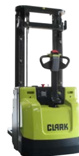
SX16 1,6t Capacity Max Lift: 5,210 mm