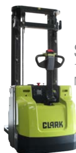
SX12 1,2t Capacity Max Lift: 5,210 mm